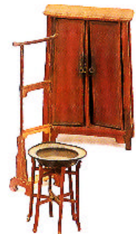
Similar cabinet excavated from Ming (1368-1644) tomb, Shanghai Museum

This sample tells exactly Ming-style scholar's cabinet usually made during the late Ming Dynasty through early Qing Dynasty (16 th – early 18 th century). For inexplicable reason this type of round-corner cabinets are also called in northern areas Miantiaogui (noodle cabinet). The top frame of the cabinet slightly protruding on three sides is called Guimao (cabinet's hat). The legs of such a cabinet were usually designed in a splayed way, being a little narrow on the upper part and wider at the lower level. This was supposed to help the door close up automatically in case the user