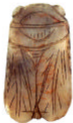
Cicada, white nephrite, 13 th / 14 th century, 2" L

During the Ming and Qing dynasties (1368-1644), jade cicada was well developed into various ornamental patterns for people's life. The carving was delicate and the best materials were selected. Similar to other creatures in jade carvings, the cicada at that time was no more than an amulet.