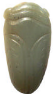
Cicada, celadon nephrite. 18 th / 19 th century, 2 1/8" L