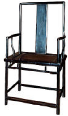
Ming-style southern official's hat armchair with high back Zitan wood 22.5" W, 18.25" D, 20.25" H (seat), 43" H (overall) sold

Zitan wood belongs to the Pterocarpus genus, which itself is a member of the Leguminosae family. Within this genus there are about fifteen species, most of which grow in the tropics. Zitan wood used in cabinetmaking is rarely found in large pieces and is in fact much closer to rosewood ( Pterocarpus indicus ). From very ancient times, the Chinese have considered zitan the most precious wood therefore fewer furniture pieces were made from it than other woods including huanghuali. Zitan wood is the hardest and heaviest of all hardwoods. Most examples are purplish-black, but some pieces are as black as lacquer, so that the grain is virtually invisible.